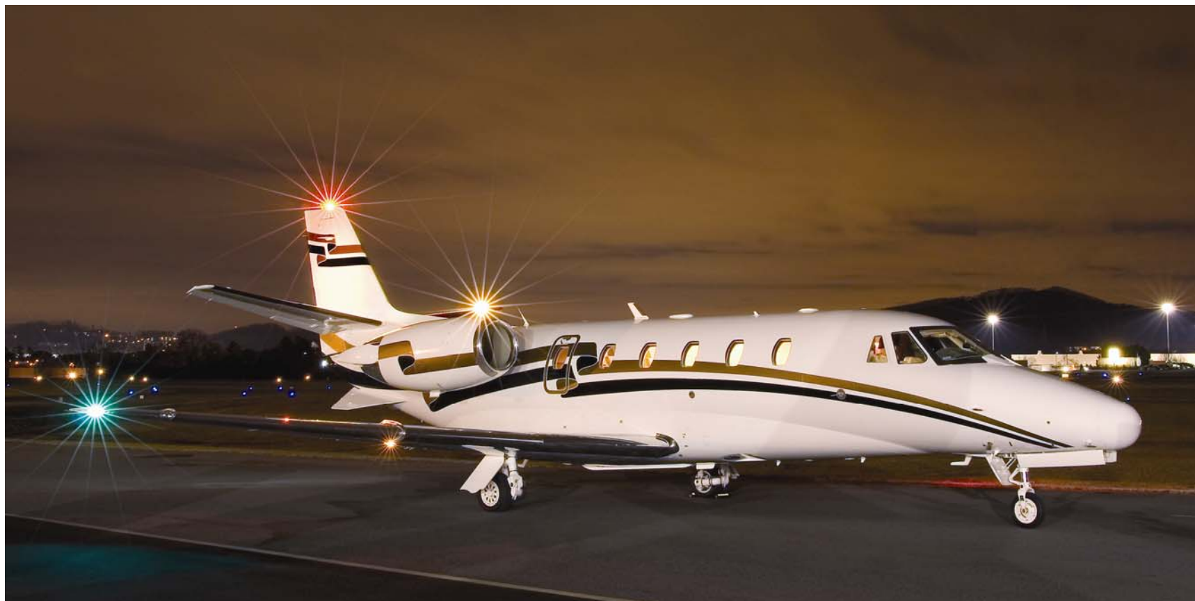
Citation Excel - N227MC