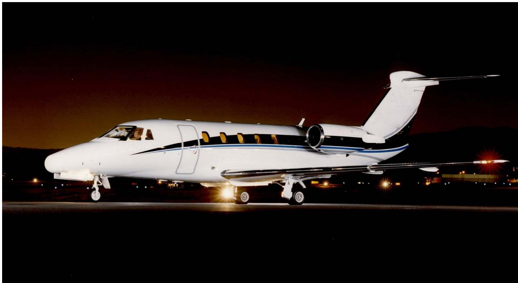
Citation III - N72EP