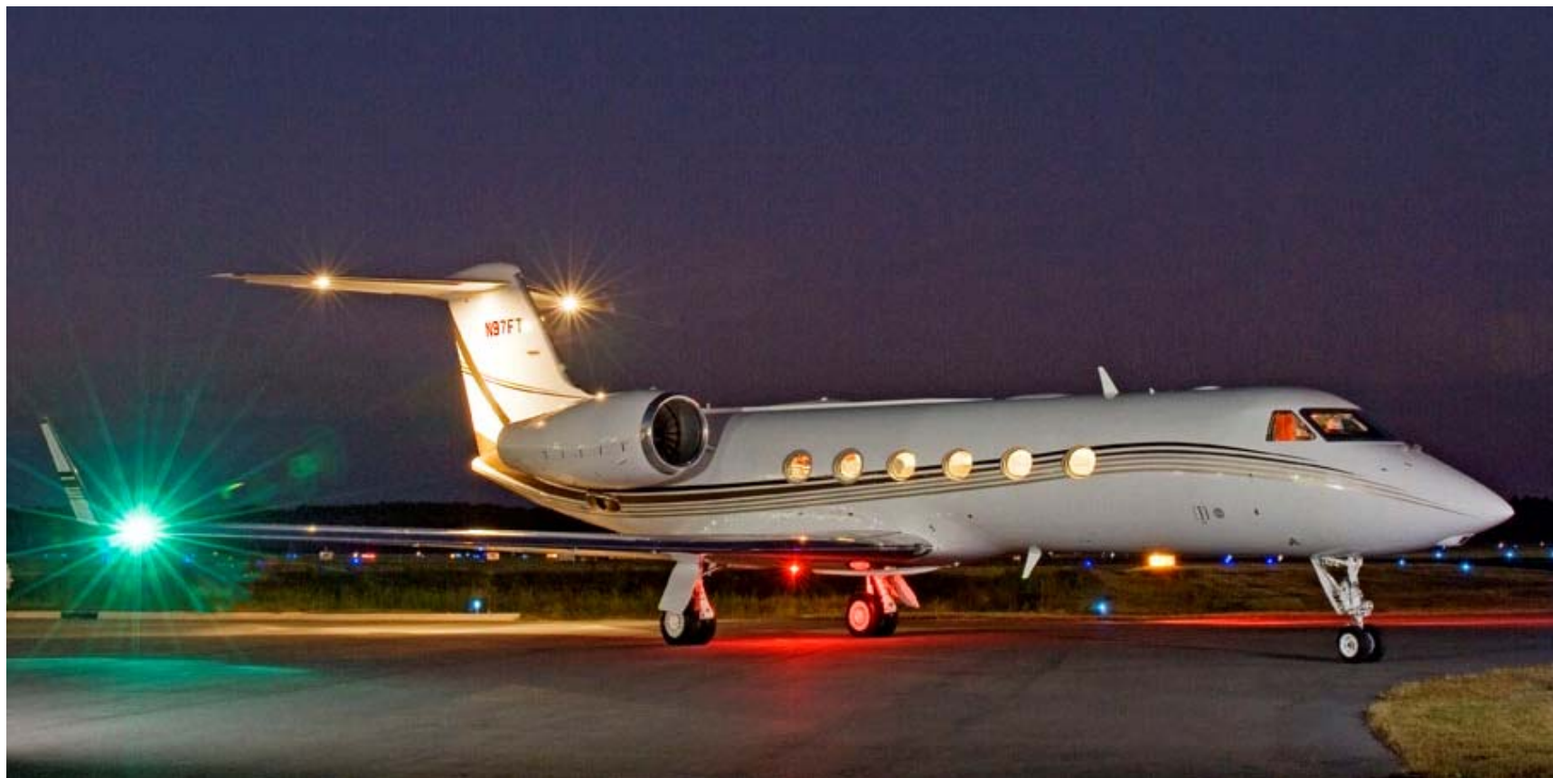
Gulfstream 450 - N97FT