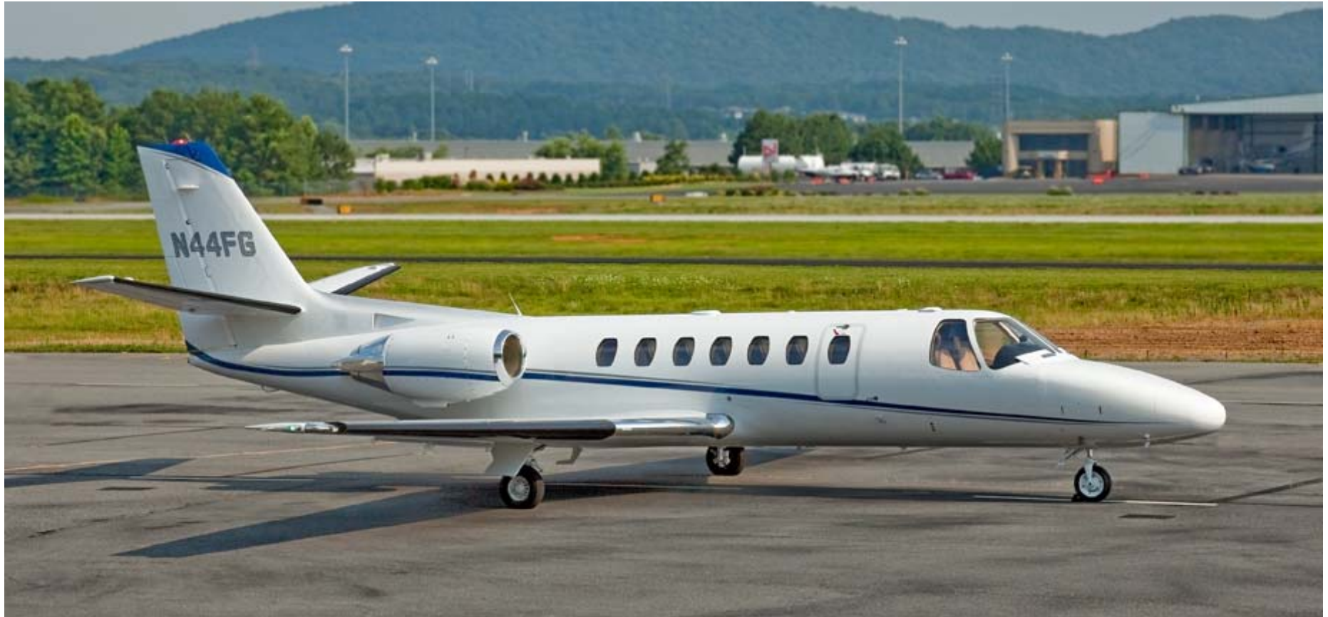
Citation Ultra - N44FG